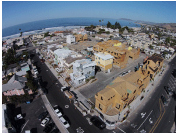
Vistas at Pismo Village