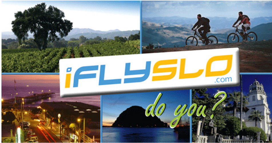
San Luis Obispo County Regional Airport