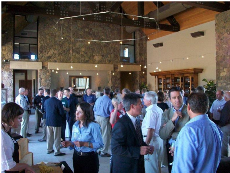
July 2010 Board Meeting and social hour Social hour sponsored by Niner Wine Estates

EVC Sponsors are welcomed to Board meetings and social hours