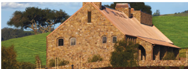
Niner Wine Estates

EVC Sponsors are welcomed to Board meetings and social hours