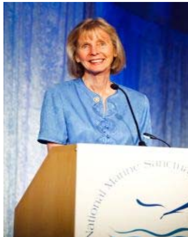
Congresswoman Lois Capps