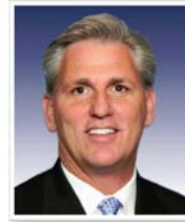
Rep. Kevin McCarthy

As unemployment continues to hover around 10% nationwide and much higher in California, policies coming out of Washington need to help create an environment conducive to economic growth and job creation. Unfortunately, many of the policies and regulations over the last several years have added uncertainty and burdened hardworking American families and small businesses with unfunded mandates.