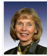
Rep. Lois Capps

Creating jobs and getting our economy back on track remains my number one priority as I look ahead to the 112th Congress. Small businesses are essential to our economic recovery, having created nearly two-thirds of all new jobs over the last fifteen years. In particular, our vibrant local green businesses are a shining example of the incredible potential for economic growth and job creation here on the Central and South Coasts. The 111th Congress has taken aggressive steps to help small businesses access the capital they need to expand and hire in addition to creating incentives for green businesses to grow. I am hopeful that the leadership of the 112th Congress will continue these efforts.