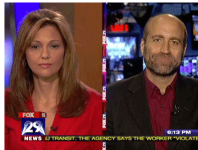
Featured segment on Fox News, September 15, 2010 6:31 PM EDT